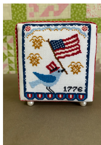
A Bluebirds Salute (Luminous Fiber Arts) Stitched by Linda Bell